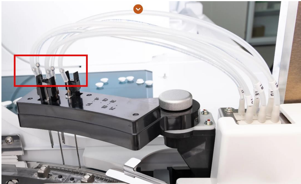
Overview of Rinse station 1

Check the tubes of Rinse station 1 for any damages on the whole length. The most critical part is the connection between tube and needle (see red box in the picture).