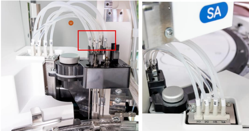
Overview of Rinse station 3

Check the tubes of Rinse station 3 for any damages on the whole length. The most critical part is the connection between tube and needle (see red box in the picture).