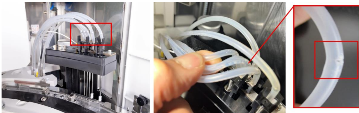
Overview of Rinse station 2

Check the tubes of Rinse station 2 for any damages on the whole length. The most critical part is the connection between tube and needle (see red box in the picture).