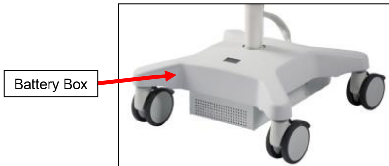
Figure 3 – bk3000, bk3500, bk5000, bkActiv

See Figure 3 for how to identify that your system is equipped with batteries (Model No. 2300-66, GTIN 05704916000264)