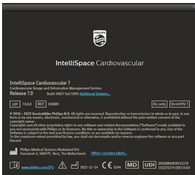
Figure 1. About Screen example